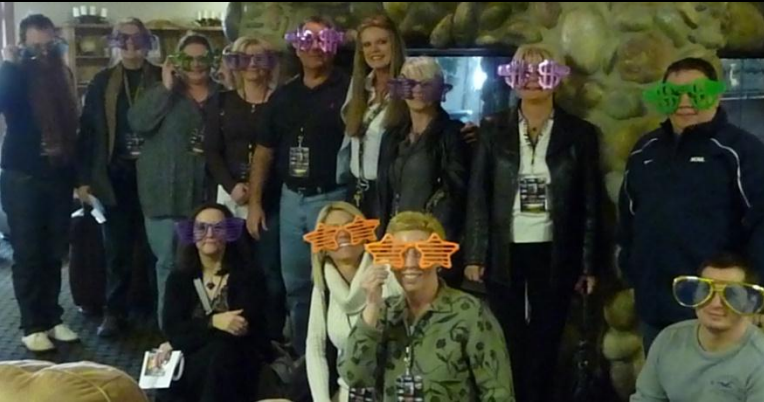
Tour of the Billings Hotel & Convention Center