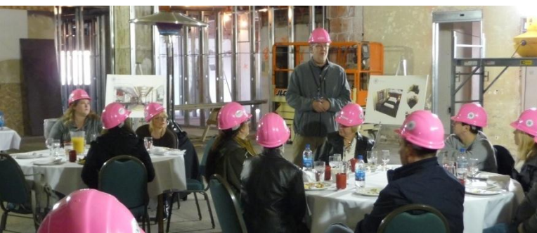
Hard hat tour and breakfast at the Northern Hotel