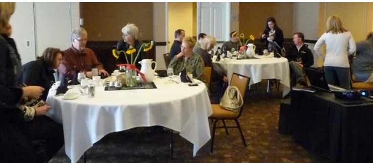
Lunch at the Hilton Garden Inn