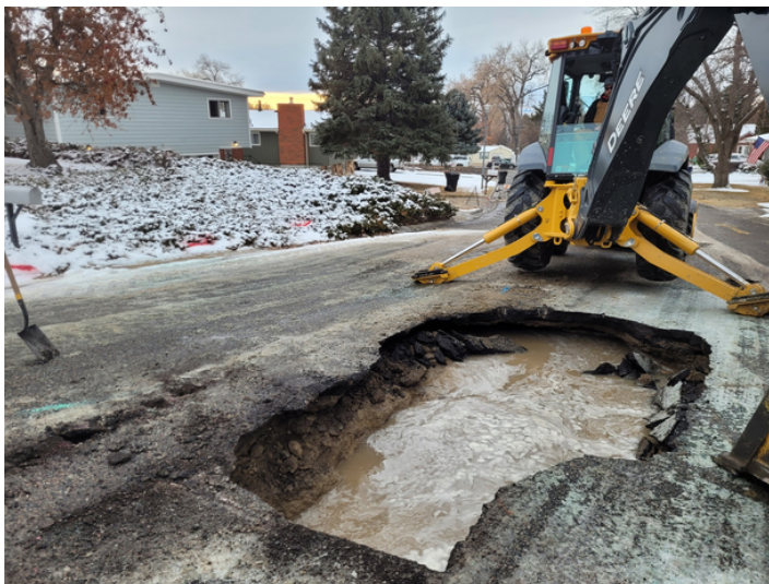
The City of Billings Public Works Department manages an annual water main replacement program in an effort to avoid breaks such as the one pictured (Fairway Drive, January 10, 2024). The City applied for $1.4 million in funding assistance for two water main and one stormwater replacement projects in 2024 and 2025.

House Bill 355, passed by the Montana State Legislature in 2023, makes available to the City slightly more than $1.4 million to help pay for critical infrastructure repair and maintenance projects. Projects recommended by the HB 355 included those for drinking water, sewer, and fire suppression connected with water services, in addition to other municipal projects. Two water main and one stormwater replacement projects were selected due to the size of the projects and the City's ability to provide at least 25% local match to the state funding. The City submitted three project applications to the Montana Department of Commerce as required by the law for funding support. The water main projects have received preliminary approval and the stormwater is awaiting a funding decision.