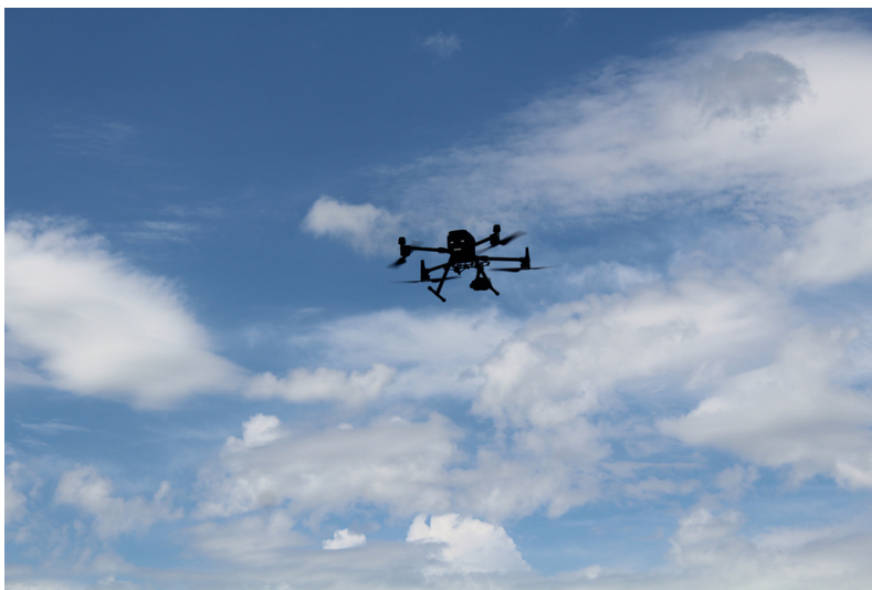
The Billings Fire Department received $10,000 in funding toward equipment to continue building their incident response drone program.

The City of Billings Fire Department received a $10,000 grant from Plains All American Pipeline company (Plains First Responder Grant Program) to fund the equipment needed to continue building their hazardous materials/major event response drone program.