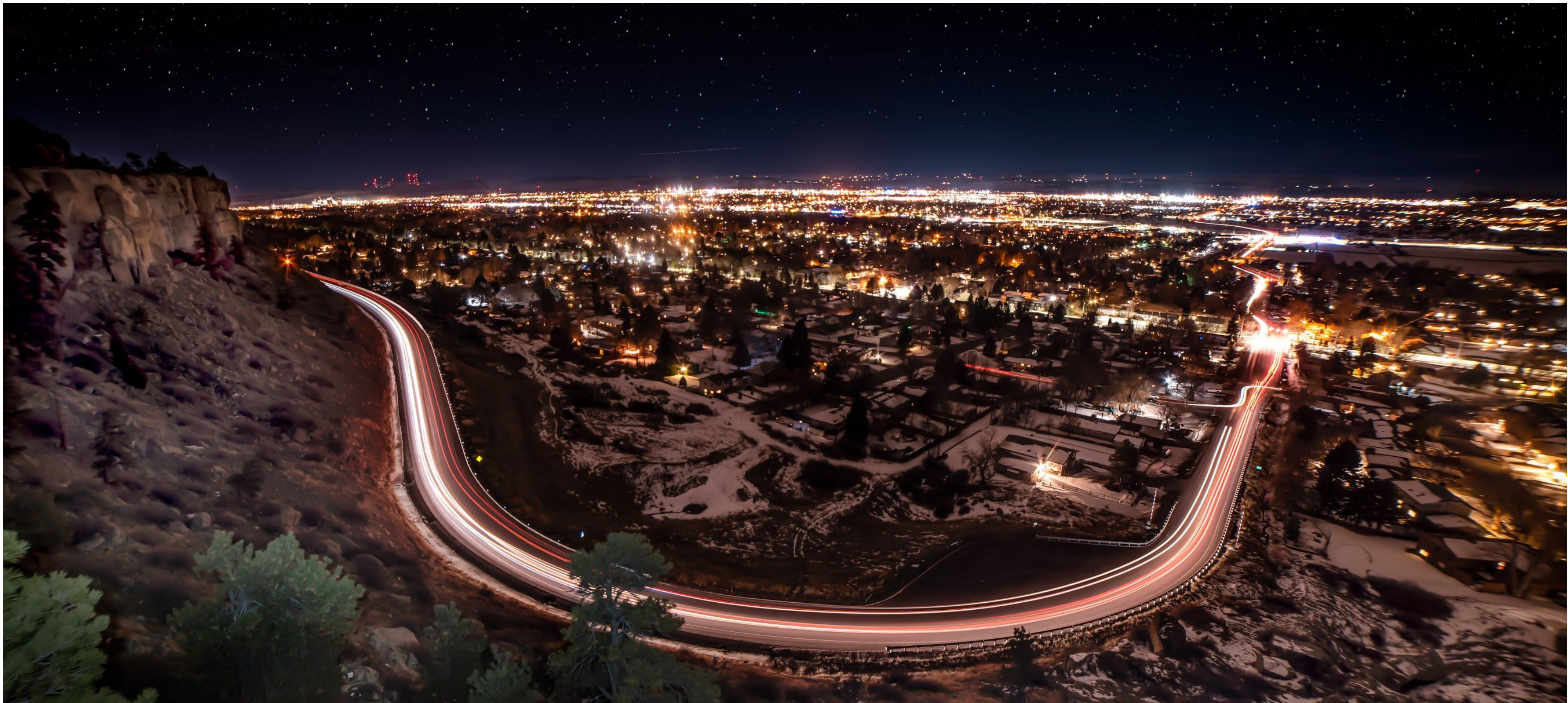
Zimmerman Trail automobile connection from Rimrock Road to Highway 3. Stagecoach Trail will parallel Zimmerman to the east and below the road.