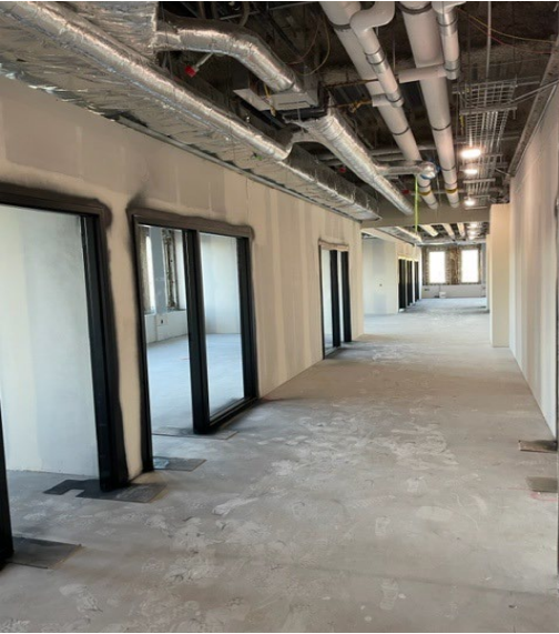
5 th Floor: