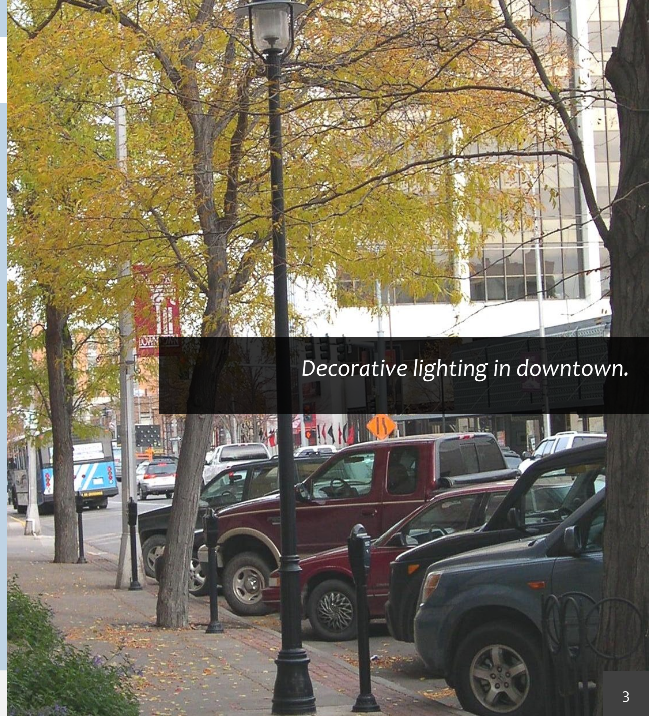
Decorative lighting in downtown.

The Street and Traffic Division maintains 4,484 lights annually!