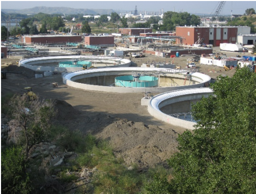
The original Aeration Basins (Abs) and Secondary Clarifiers