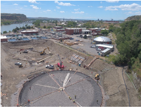
Nearing completion of the new Secondary Clarifiers