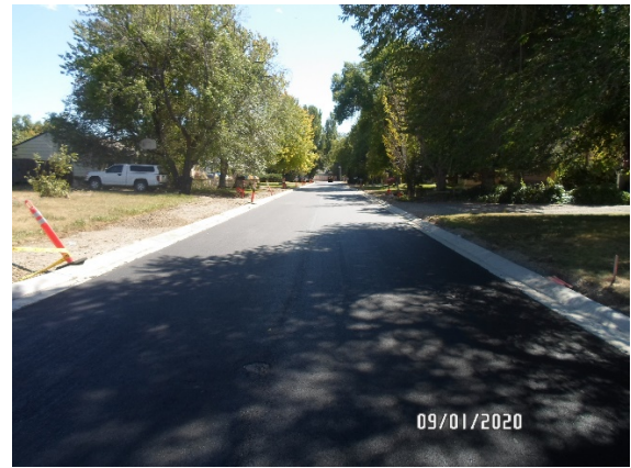
Vickery Before and After