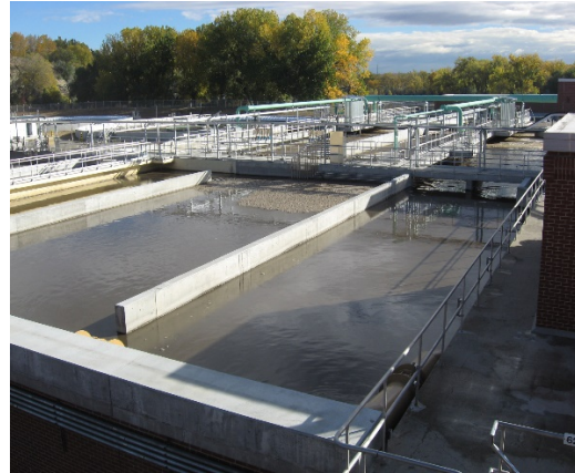
The walkways on top of the new Bioreactors