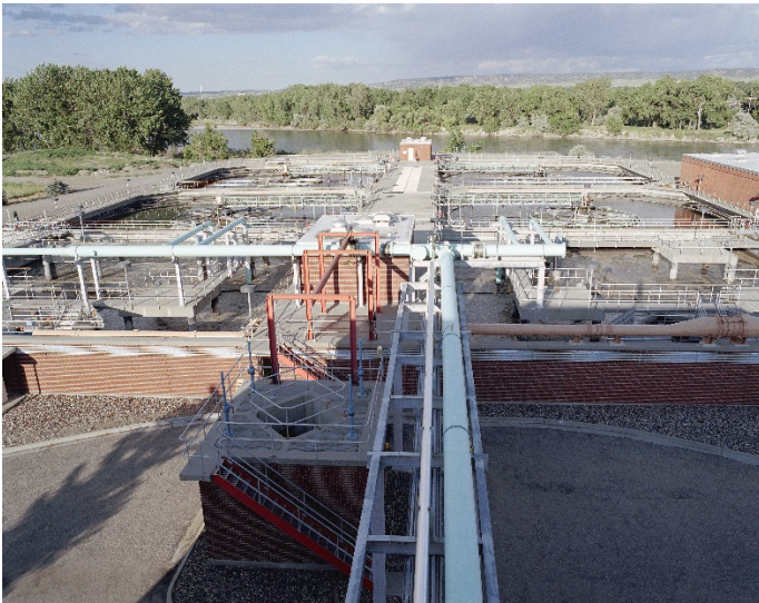
The new Secondary Clarifiers operational with active construction of the bioreactors