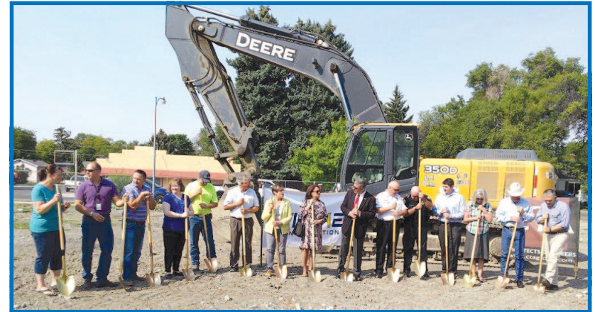
New 9-1-1 Center Groundbreaking Ceremony on August 31, 2017

Billings City/County 9-1-1 has recently implemented Text-to-911 and has received a handful of calls for help since this function has been available. Montana is one of the leading states in the nation to provide Text-to-911 coverage. People needing emergency services are encouraged to call 9-1-1 if they are able, but now texting is available. 9-1-1 staff are also currently revamping call taker/dispatcher