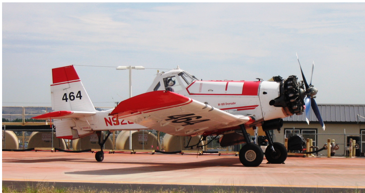
Single Engine Air Tanker (SEAT) operated by BLM